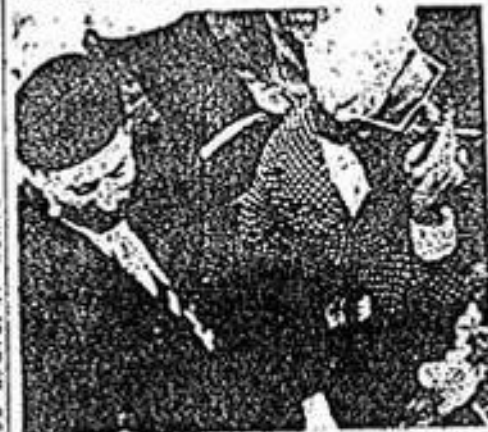
Former King Carol of Romania and Mme. Elena Lupescu are seen here at a luncheon held for Cuba and Mexico.